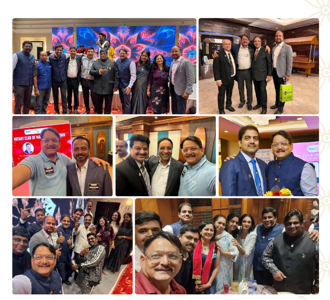
President Shalin attended the installation of the following clubs in the District held at various places .