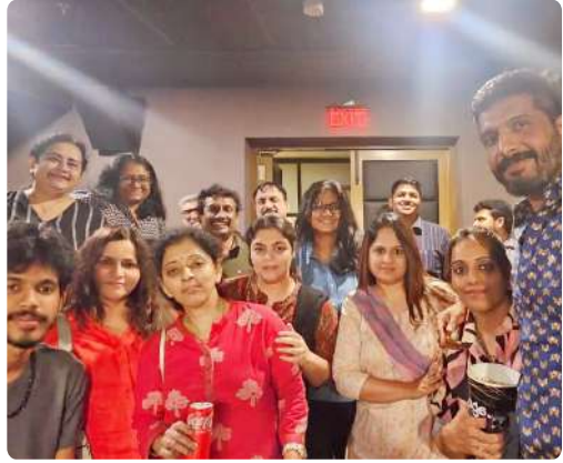
Special screening of the movie Indian - 2 at AGS Cinemas.